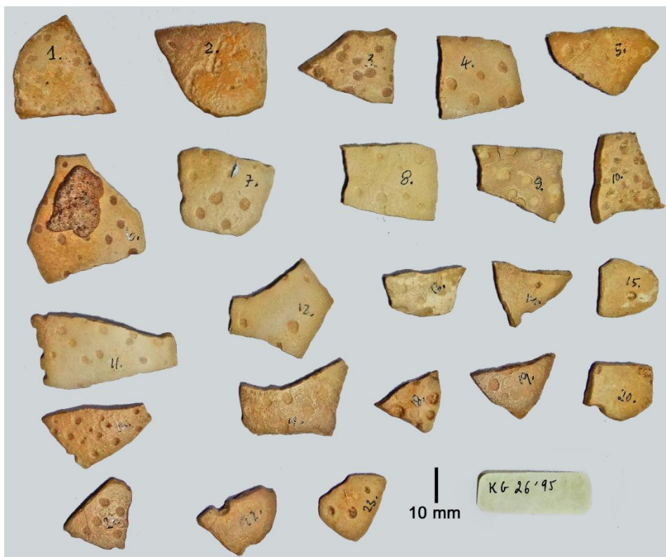
Figure 2. GSN KG 26'95, images of the external surfaces of 23 eggshell fragments of Diamantornis karingarabensis from the type locality of the species

are concentrated, the shell between the depressions being smooth and devoid of pores. The depressions range in diameter from 2.4 to 2.7 mm and are randomly distributed over the surface of the shells.