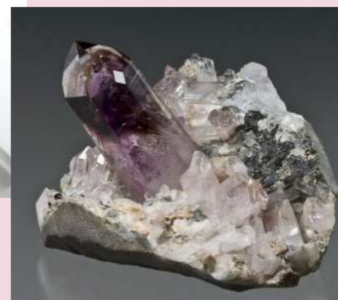
Fe-oxide stained quartz, Orange River

Private mineral collectors and researchers need a permit from the Ministry of Mines and Energy for all material collected or purchased, while the export of mineral specimens for commercial purposes in addition requires a permit from the Ministry of Trade and Industry (it is advisable to allow two working days for the issuing of the permit). The collecting and export of any fossils, including fossilized wood, and meteorites is prohibited by law and regarded as theft.