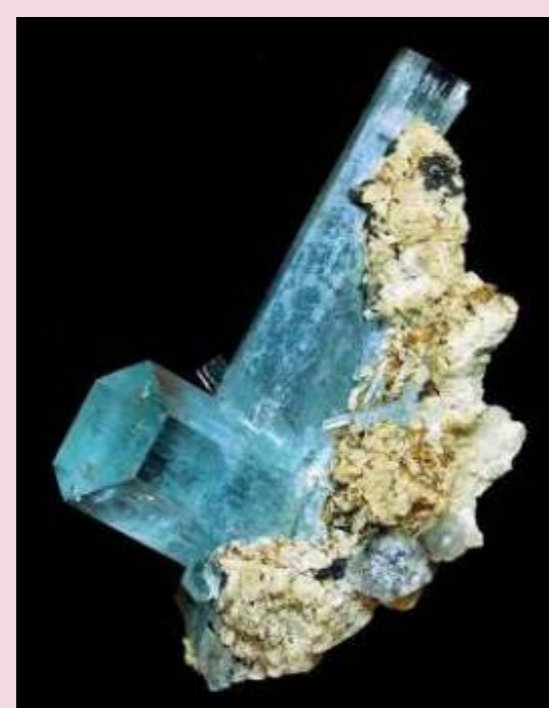
Beryl, var. Aquamarine from the Erongo Mountains