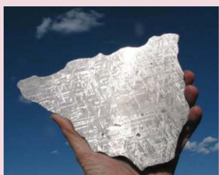
Polished meteorite from the Gibeon Meteorite Swarm

For more information contact: Ministry of Mines and Energy The Mining Commissioner 1 Aviation Road, Windhoek (opposite Safari Hotel) Opening hours: Monday to Friday 800h - 1300h and 1400h - 1700 h Tel. (061) 284-8111