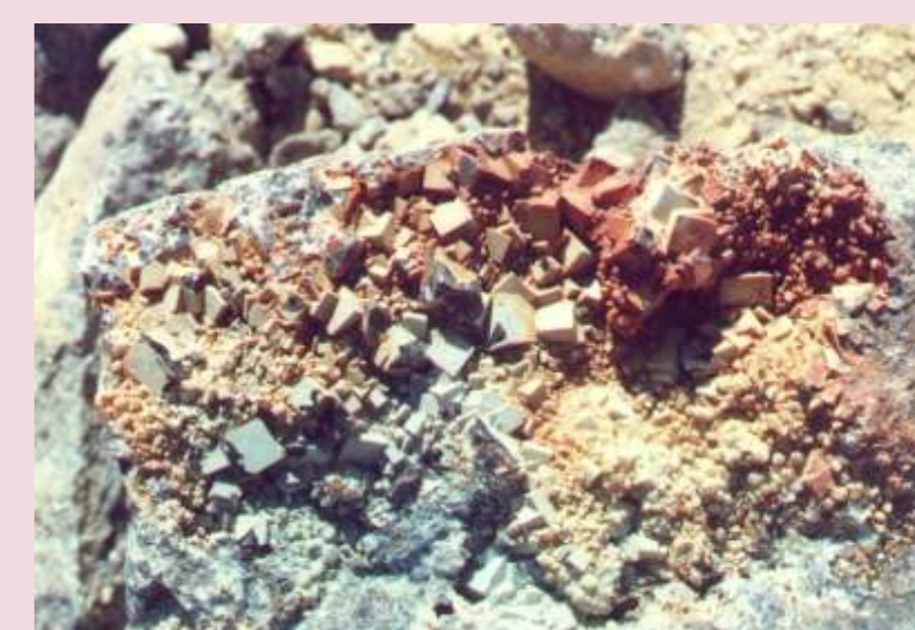
Fluorite, Okorusu Mine