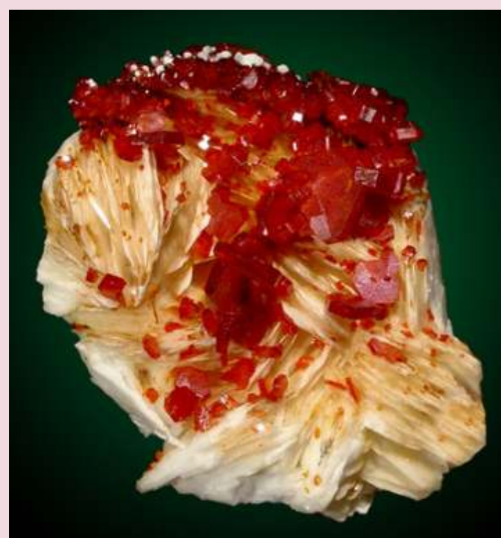
Vanadinite, Otavi Mountains

Here is what you need to know about collecting in Namibia