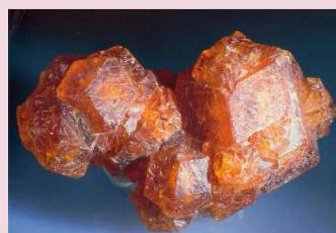
Mandarin garnet, Kaokoveld

Claims for semi-precious stones are reserved for Namibian nationals, many of whom make a living by digging for gemstones, amongst which tourmaline, topaz, aquamarine, garnet and amethyst are the most common, and selling them in roadside stalls. Collectors' specimens are also sold by a number of formal stores in Windhoek and Swakopmund.