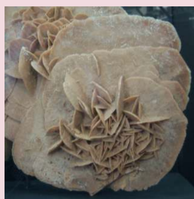
Gypsum "rose", Namib Desert