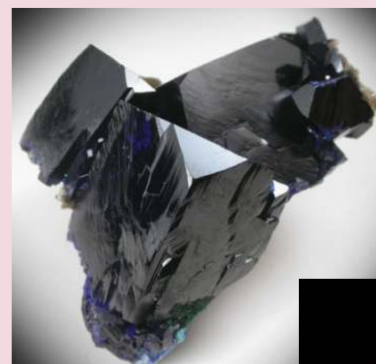
Azurite (left) and malachite (below) from Tsumeb Mine

Famous for its exceptional variety in precious and semi-precious stones, Namibia hosts such world-renowned mineral localities as Spitzkoppe, Erongo and Brandberg, amongst others, which are being visited by many professional and hobby collectors each year. But while we are proud to share this heritage with those who appreciate it, there are certain rules and regulations to be followed, when exporting minerals.