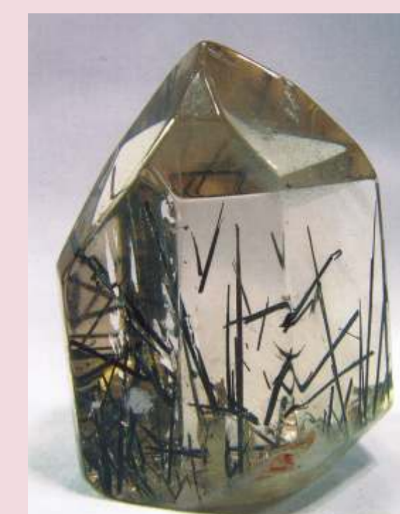
Quartz crystal with tourmaline needles, Gamsberg (above)