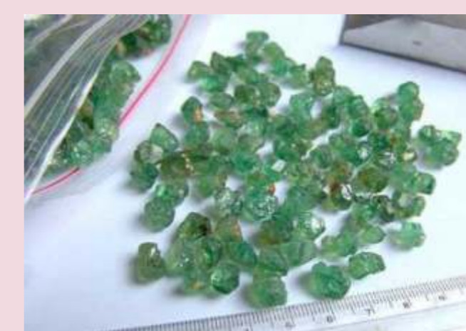
Andradite, var. Demantoid, Erongo