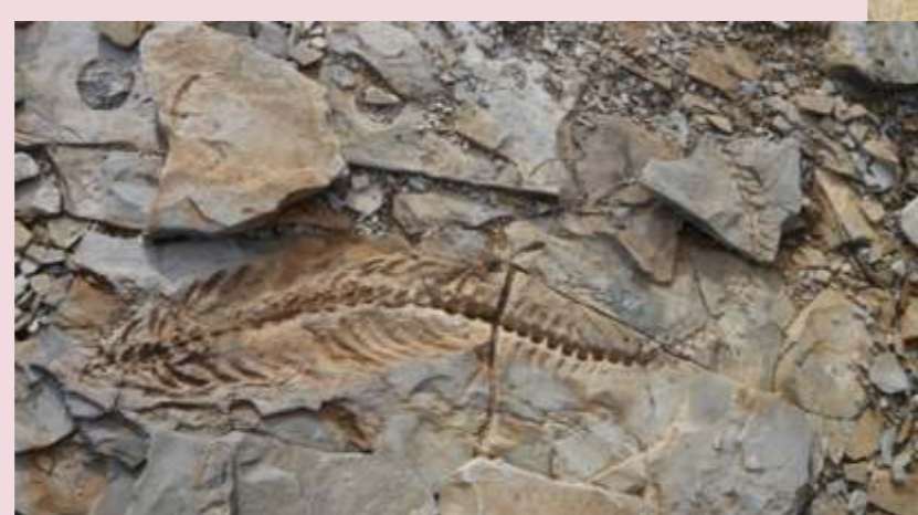
Backbone of Mesosaurus tenuidens

Private mineral collectors and researchers need a permit from the Ministry of Mines and Energy for all material collected or purchased, while the export of mineral specimens for commercial purposes in addition requires a permit from the Ministry of Trade and Industry (it is advisable to allow two working days for the issuing of the permit). The collecting and export of any fossils, including fossilized wood, and meteorites is prohibited by law and regarded as theft.