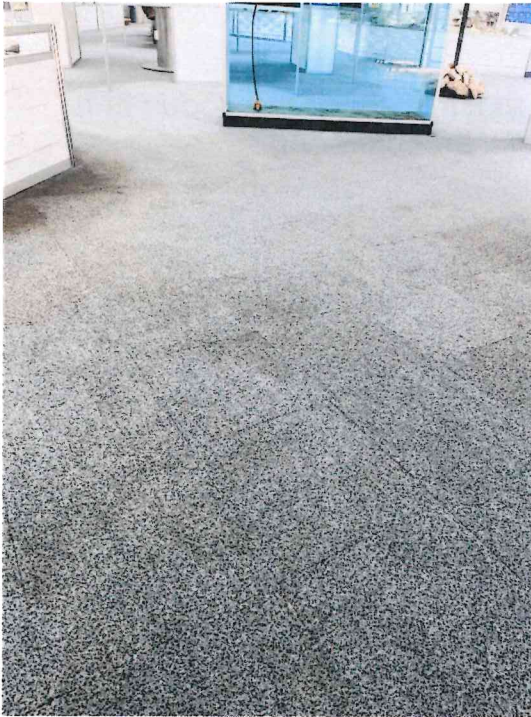
Fig. 1: Old Carpet