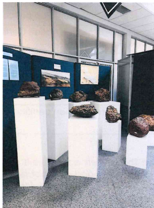
Fig. 4: Meteorites moulded on Marbles